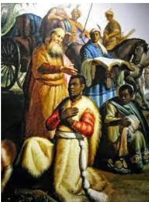
'The Baptism of the Ethiopian' by Rembrandt

Pharisee: a Jewish leader who wrote and enforced religious law at the time of Jesus. Pharisees thought that they were better than everyone else.